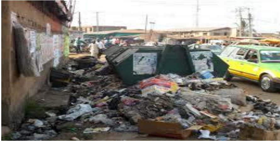
Fig. 2: An overflowing bulk storage container in the street of Ilorin