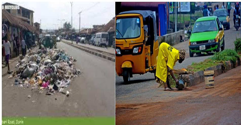
Fig. 1: The littered street and the Cleaning Agent at Work in the city of Ilorin

Littering is an environmental pollution problem, particularly in those areas where population density is relatively high (Climate Policy Watcher, 2020). This problem raises concern among different stakeholders, hence finding ways to tackle it is paramount, moreover at a world conference held in 1992 on environmental management and development, littering of surrounding was globally tagged as a major barrier in the pathway to sustainability by all nations (Earth Summit, UNCED, 1992). Litter is untidy, injurious and hazardous to the health of humans and nonhuman species in a particular setting or area. However, due to human needs for survival and crave for development, a way out on this menace have been created (Climate Policy Watcher, 2020; Onibokun, 1999). A huge amount of resources running into Billions of naira is spent annually by the Federal Government of Nigeria to tackle this menace via Street sweeping, pro-littering prevention campaigns on both mass media like radio, television and billboard aiming at modifying people's behavior towards littering, promulgation of law to avert littering and indiscriminate dumping of refuse into gutter, tunnels and rivers (Ajaegbo et al., 2012). Littering prevention behavior has been revealed as an implicit method of addressing the problem of littering disposal action (Ojedokun, 2016). The high rates of littering in most countries is leading to health and