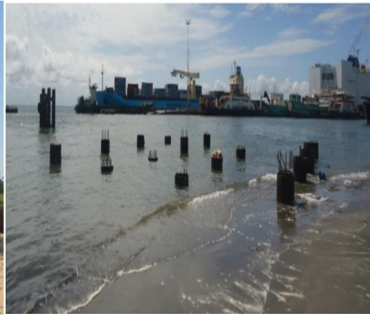
(ii) Old Wharf at the Banjul Port