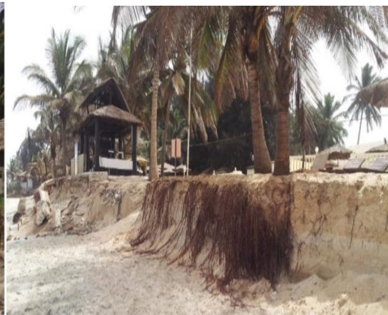
(iv) A Structure at Risk Due to Coastal Erosion