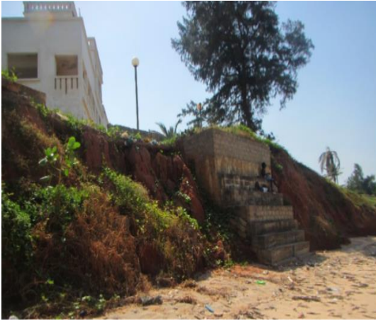
(i) Old Wharf at the Banjul Port