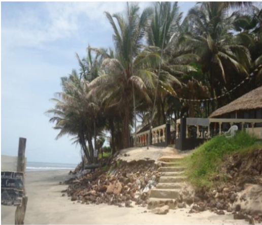
(iii) A Structure at Risk Due to Coastal Erosion