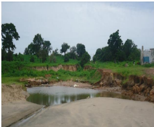
(v) Coastal Erosion along Kololi