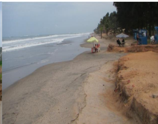
(vi) Eroding Cliffs along the Coastline