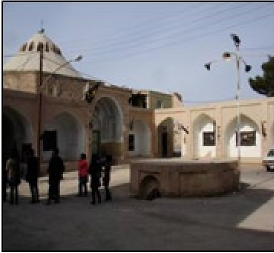
Fig. 11: Regular and geometric interior design and independent wall space