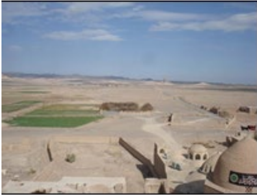
Fig 9: Part of the land that was previously cultivated