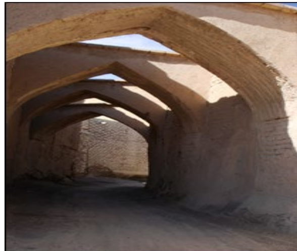
Fig. 6: Use sabats and shades

is the availability of social security. The existence of social security in the neighborhoods is due to the hierarchy of accesses and places, as well as social cohesion and solidarity. One of the most prominent sociological characteristics of the people of these neighborhoods is their collective participation in cultural activities, particularly religious activities, which are normally carried out autonomously but in collaboration and communication with other neighborhoods. It has manifested itself in various ways, such as the Muharram decade festivities held in local squares (Karimi and Madani, 2020; Shoaie et al., 2013). The influence of ethnicity, kinship, profession,