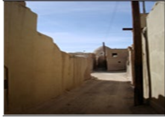
Fig. 10: Formation of climate-compatible architecture for more compatibility with the hot and dry climate of the region

architecture and the creation of enclosed spaces for the use of shadows have been among the solutions for adapting to the hot and dry climate of the region (Fig. 10).