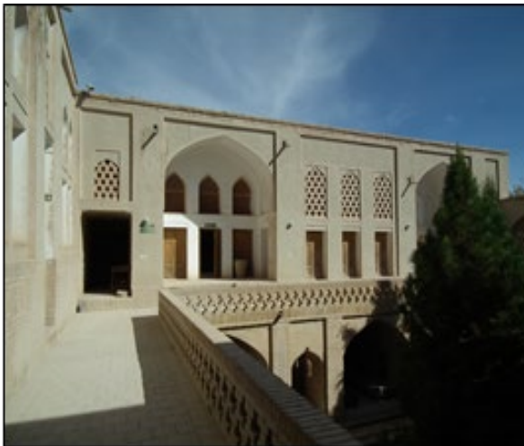
Fig. 5: Introversion of private and public buildings View from inside the Pirnyia house