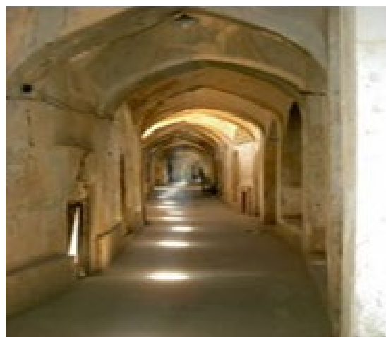
Fig. 8: Naeen City market as the backbone of the city