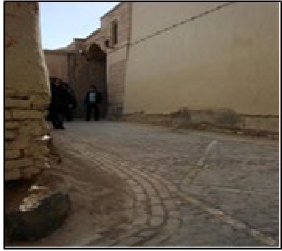
Fig. 12: Organic design of open spaces of passages