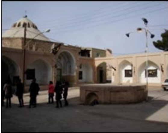
Fig. 3: Physical and functional centrality