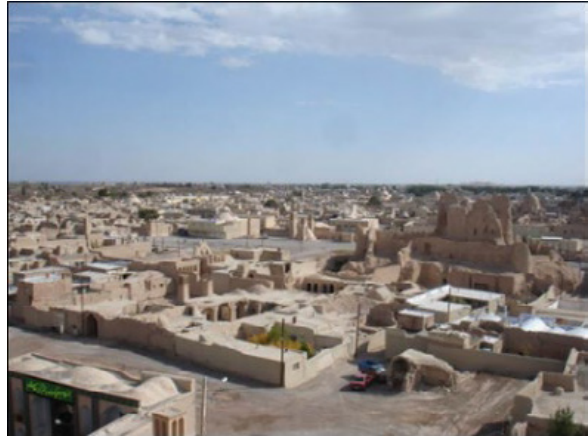
Fig. 4: Physical texture cohesion