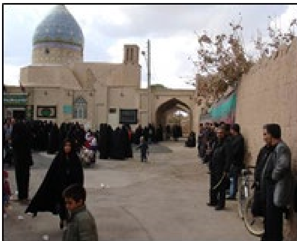
Fig. 7: Presence of people in squares and public

The city of Naeen with an altitude of about 1600 meters above sea level is located on the southern edge of the central desert of Iran, which of course creates a hot and dry climate in this region. The absolute maximum temperature in 1996 was 41.2 degrees Celsius and the absolute minimum temperature was 19.2 degrees Celsius. Also, the average annual rainfall in Naeen is about 109 mm. Therefore, this area is considered as part of low rainfall areas (Fig. 9). The average annual relative humidity in Naeen, according to what is recorded at Naeen station, is 36.6%, the driest month of September with an average relative humidity of 20.5%. Naeen region is one of the poorest regions in terms of water networks, which due to dry weather and lack of rainfall, no significant permanent river can be seen in it. In this area, recognizing and studying the wind is of great importance the prevailing wind is the westerly wind. The highest wind speed is related to the south wind with 7.1 meters per second, followed by the southwest winds in Naeen in terms of seasonality in all seasons. In the four climatic divisions in Iran, Naeen is mentioned in the Central Plateau climate, in which the dry southwest winds have caused dry air. The formation of climate-friendly