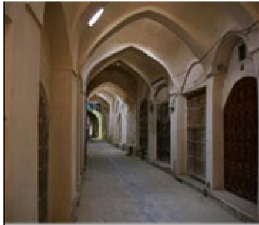
Fig. 13: The principle of symmetry, balance, rhythm in the design of walls

are classified as qualisigns, sinsigns, and legisigns respectively (Albert, 2013; Marais, 2018; Zhang and Sheng, 2017; Zhao, 2019; Cuccio and Gallese, 2018).