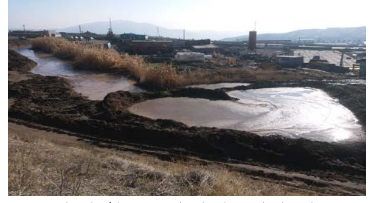
Fig. 4: The sight of the unmanaged sand washing mud in the study area

results, the largest share related to the stage of sand washing and the release of sand washing mud resulting from this process equals -3.6. Considering the damage caused to the landscape and ecosystem of the region, and the harm it can cause to the natural environment, human, animal, and plant health, the management of sand washing mud left from this operation is the most significant step in improving the project (Fig. 4). The management of sand washing mud under investigation can reduce the short-term, medium-term, and longterm environmental harms of sand washing mud in the region and help restore the region's ecosystem. This process will also improve air quality due to the reduction of fine dust, building a reliable soil base for future developments, preventing soil erosion, reviving underground water and ensuring their health, and improving vegetation and agricultural operations by preventing sand washing mud from contaminating the area; therefore, preventing soil salinization in the long run. This issue will also help change the overall ecosystem and save manpower, lowering expenses and consuming less time.