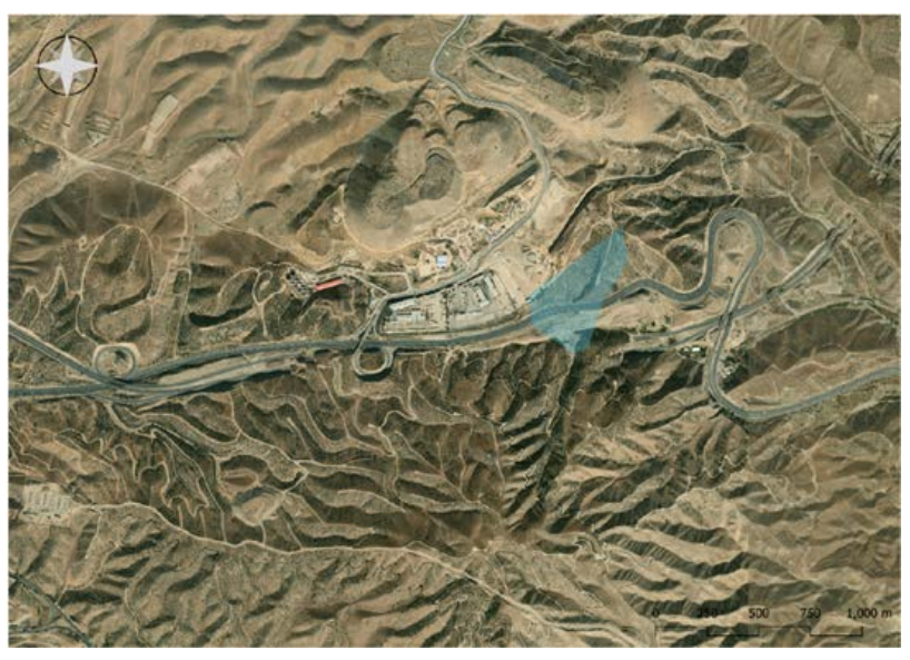
Fig. 3: The location of the Malek Shen sand recycling factory

545 hectares, and each section is specified in various utilizations according to the type of waste entering it (Majedi Ardakani et al. , 2007). With the growing importance of environmental issues and the recycling of construction materials as well as the accumulation of waste in this center, after 2010, the construction and operation of the Rigsazan factory for the reuse of C&D waste took place. From 2016 to 2021, Tehran Municipality's Investment and Partnerships Organization implemented the plan to build three more factories (Tehran Waste Management Organization, 2021). In this study, the environmental effects of sand washing mud of the Malek Shan factory have been investigated.