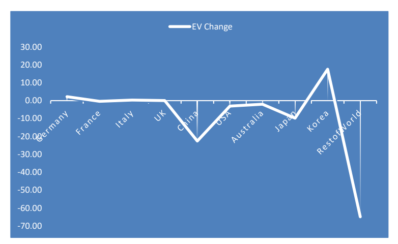
Fig. 2: Changes in welfare (in USD billion dollars)

Market prices are reflected through changes in output and trade. In Korea, the extra supply of agriculture and processed food products pushes the market price down by -26% and -29%; on the other hand, manufacturing, service, and infrastructure sectors market price increase by 12%, 4%, and 7% respectively. The market prices of all other factors and output increased marginally in Italy and the USA; market price in Japan and Australia decreases slightly. On the other hand, the market price of agricultural